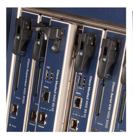
Figure 1. Cisco TelePresence MCU MSE 8510