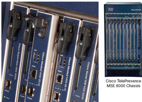
Figure 1. Cisco TelePresence MCU MSE 8510

The Cisco TelePresence ® MCU MSE 8510 blade is the industry’s leading chassis-based, high-definition (HD) multimedia conferencing bridge (Figures 1 and 2). It delivers superior video and voice with an easy-to-use, versatile management interface. Compatible with all major vendors’ endpoints (Figure 3), it maintains its capacity and performance in every configuration, delivering the best experience for each participant, every time.